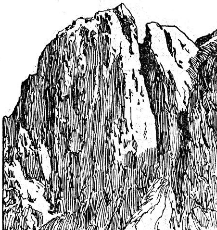
THE PILLAR ROCK